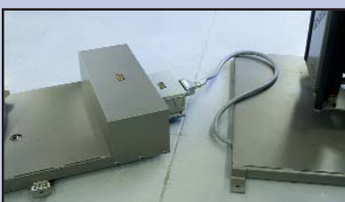
Heavy-duty Connections Between the Wrapper and Turntable

9511 West River Street Schiller Park, IL 60176, USA P 847 678 9034 F 847 671 7006 www.arpac.com