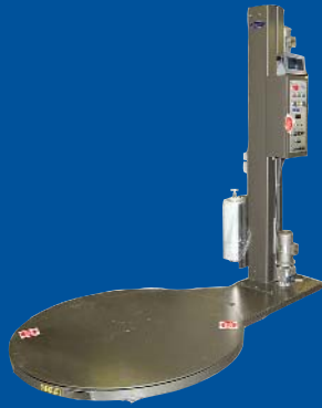
EZ-DUZ-IT Plus LP WNW