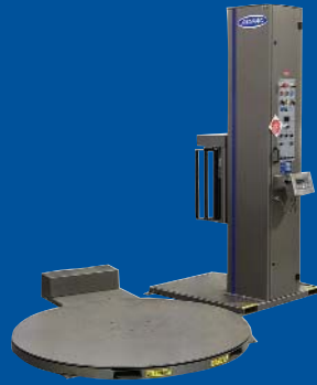
SIDEWINDER 4 LP WNW