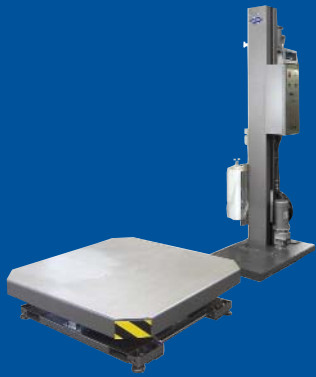
EZ-DUZ-IT LP WNW