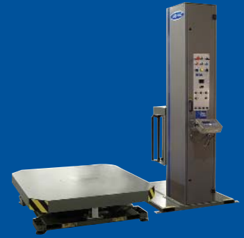
SIDEWINDER 6 HP WNW