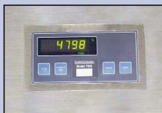
Scale Controls Integrated in the Wrapper's Control Panel